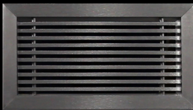
Brushed & Lacquered Finish

Rare sidewall grille with no apparent screws